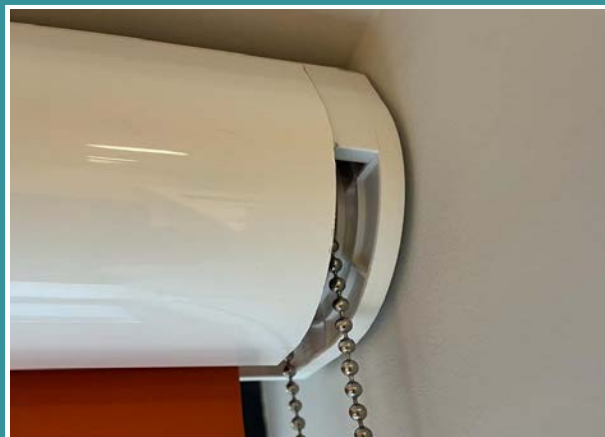
Headbox cassette to conceal roller