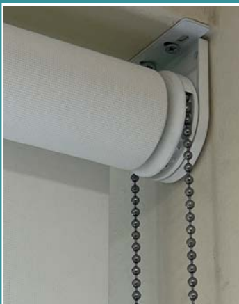
Side chain operation