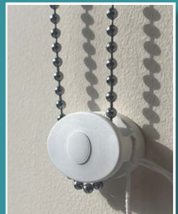
Chain tension device