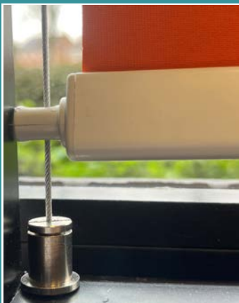
Side guide wires