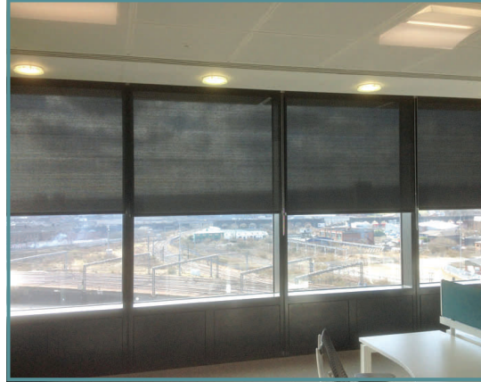
Astralux Screen Roller Blinds