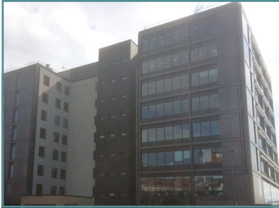
New Head Office Building