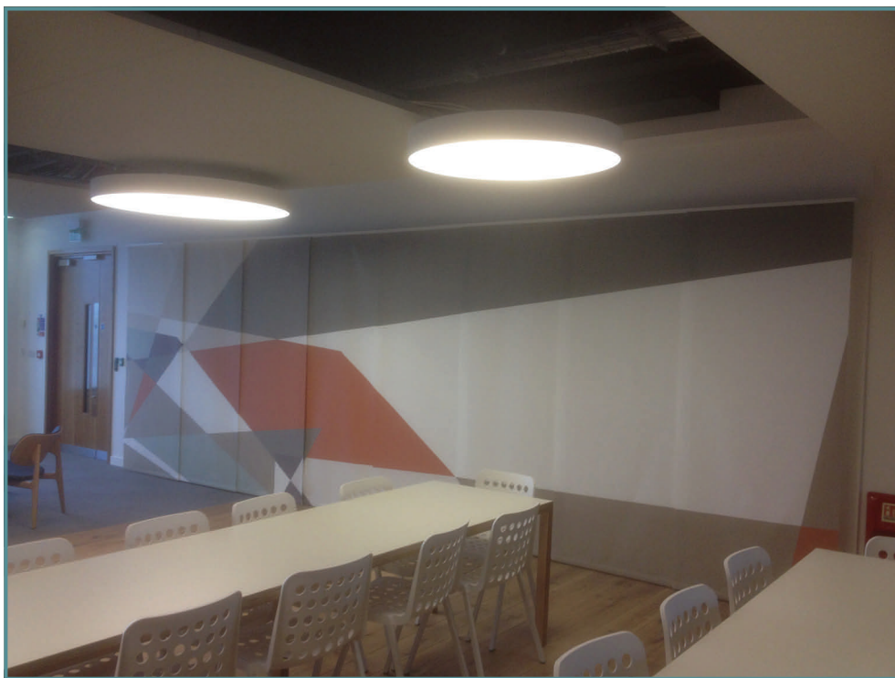
Screen printed panel blind

Please contact us for more reference sites or any further information